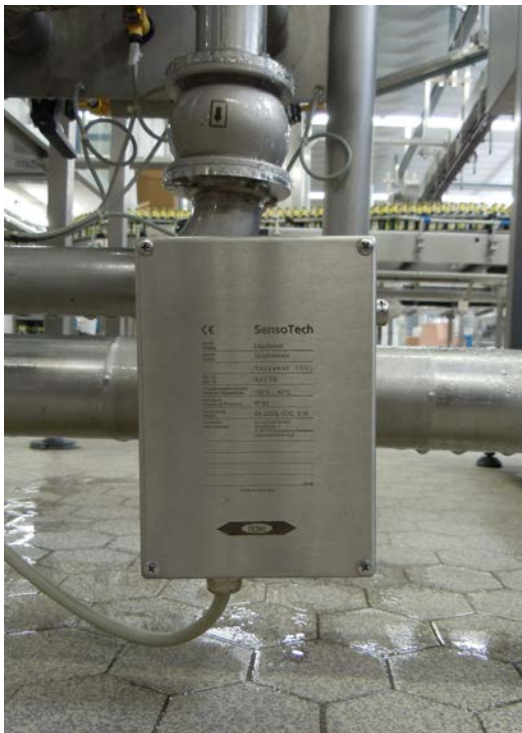
Figure 5. The LiquiSonic Varivent sensor is installed directly in the pipe of the filler at Oettinger Brewery and measures precisely the Plato or Brix concentration.

The data are displayed and stored in the controller. One controller can handle up to four sensors, reducing the investment costs of having more measuring points. As shown in Figure 7, Oettinger Brewery mounted each controller in a LiquiSonic wall housing made of stainless steel and with an IP66 (NEMA 4X) degree of protection. For process automation, the controller is connected to the process control system via Profibus DP.