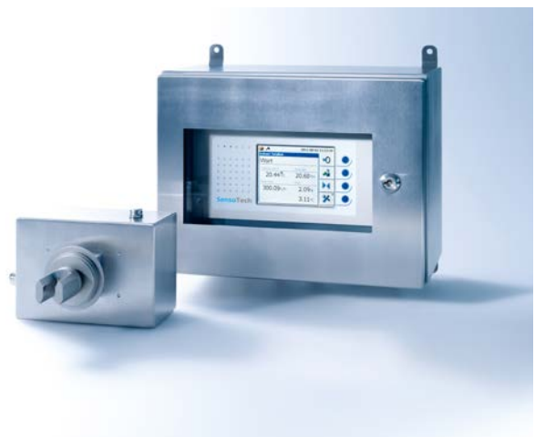
Figure 2. The LiquiSonic analyzer from SensoTech consists of one or more sensors and one controller.

In the Oettinger Brewery in Brunswick, LiquiSonic analyzers have been installed at the filler, the lauter tun, and the wort boiler. At the outlet of the lauter tun, LiquiSonic is used to monitor the lautering and to determine the extract concentration at the end of the lautering process (point to cut runoff). Using the technology the water and energy consumption have been reduced, and an economical and reproducible wort production has been realized. The runoff switchover point is of great interest, because energy costs as well as prices of raw materials are increasing continuously. A longer washout of the spent grain means high extract yields and little residual extract in the spent grains. However, a longer washout also results in a longer evaporation and, thus, higher energy costs. So it is important to detect the most efficient point to cut runoff. LiquiSonic provides stable and precise measuring results both in high concentration ranges of original gravity and in low ranges such as during runoff. The installation of the LiquiSonic immersion sensor was done with a