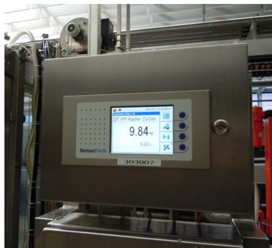
Figure 7. The LiquiSonic controller displays, saves, and transfers the Plato and Brix concentration values to the process control system.