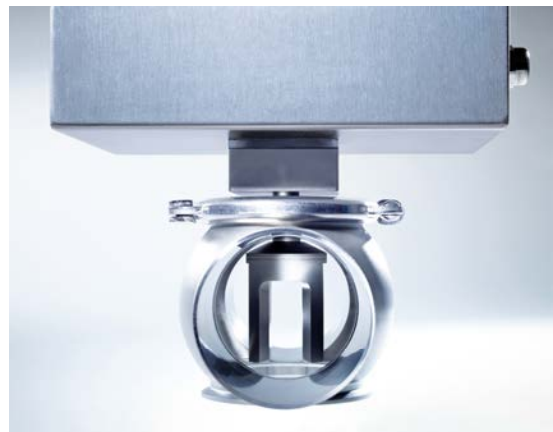
Figure 6. The sensor installation requires no bypass and is possible for any facility.

In addition to the remote access, the software includes analyzing records, visualizing process trends and creating data sheets for documentation and diagnostics. If the production process has changed for a particular product, a new product data set can be loaded on the controller via SonicWork. Furthermore, firmware updates can be transferred to the controller. Both guarantee maximum flexibility and easy handling.