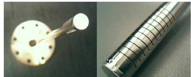
Figure 3. To avoid deposits on the sensor in the wort boiler the sensor features a cleaning adapter.