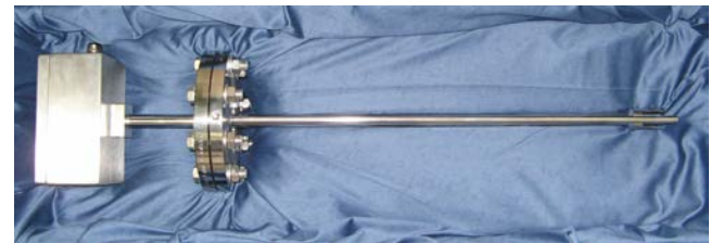
Figure 4. The cleaning adapter frees the measuring sensor component from possible deposits in the wort boiler.